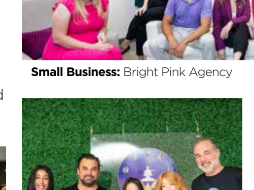
Sustainability: YOUniversal Yoga