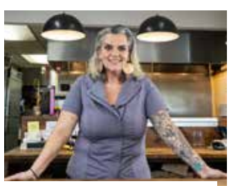
Heart of the Community: Hellenic Republic